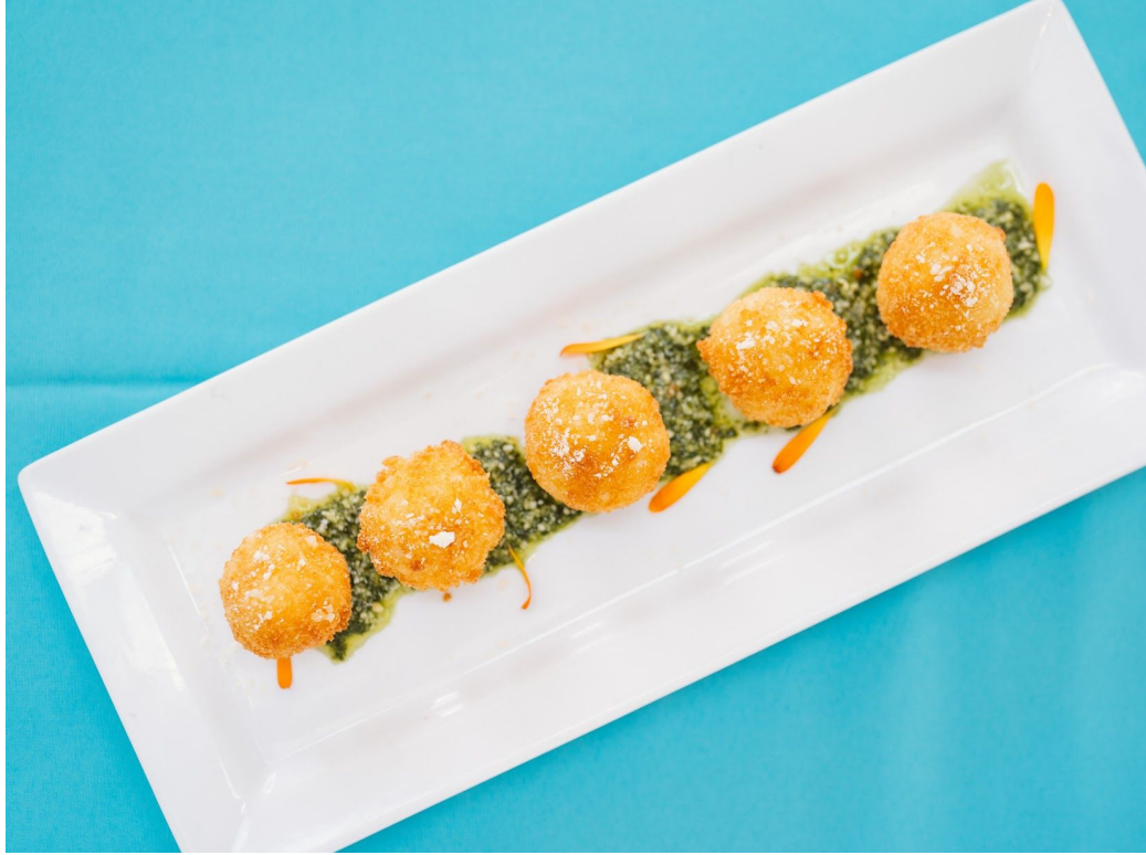
TRAY-PASSED HORS D'OEUVRES