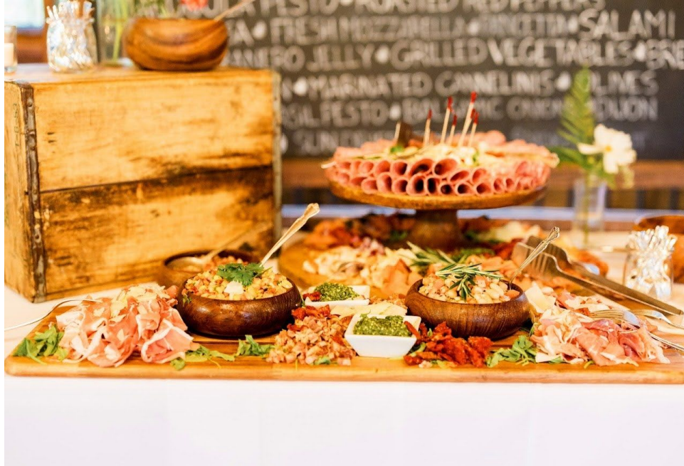
HORS D'OEUVRES DISPLAYS & PLATTERS